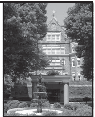
Pictured above: The Simpson House